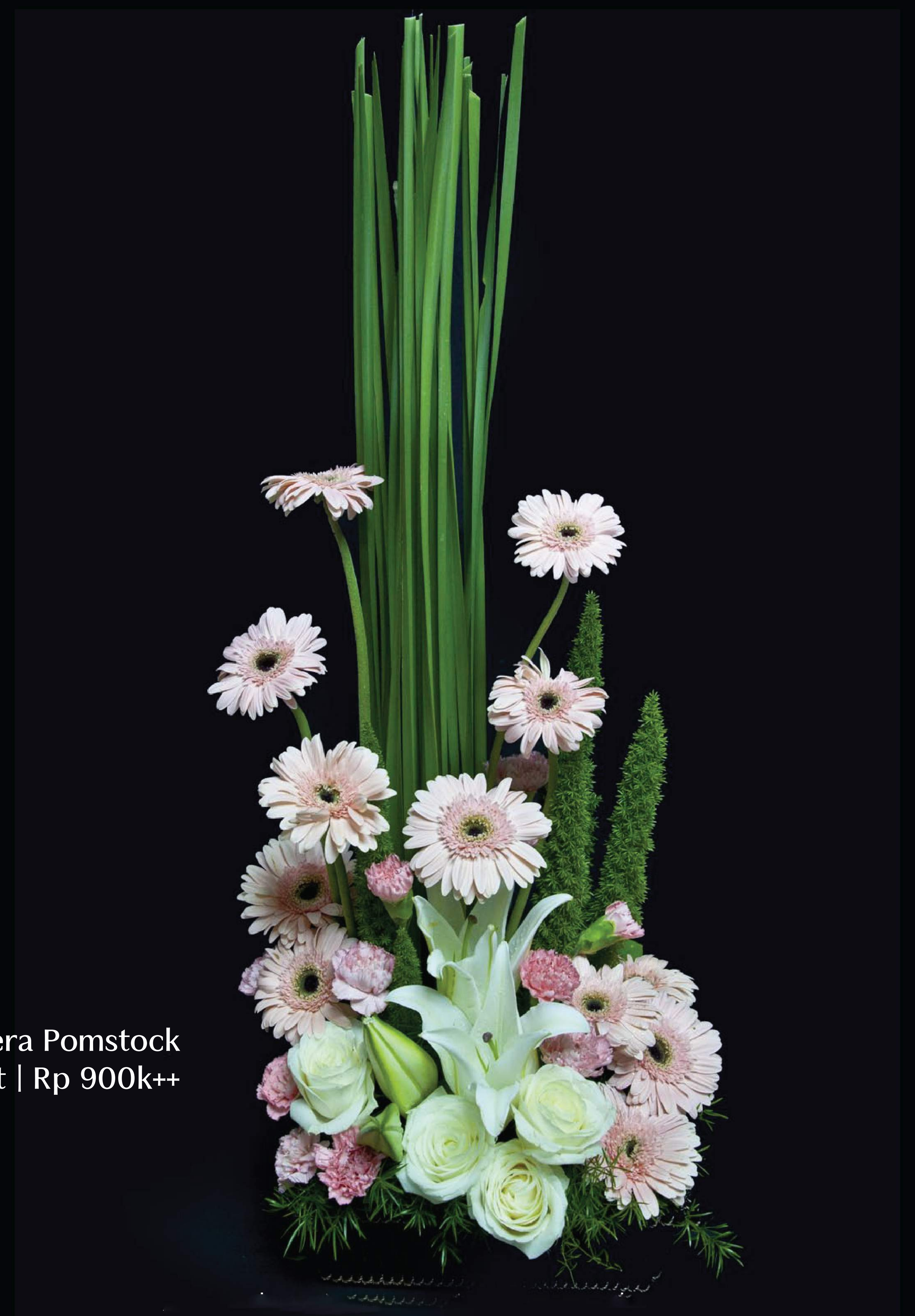
ARR 09 | Canbera Pomstock Arrangement | Rp 900k++