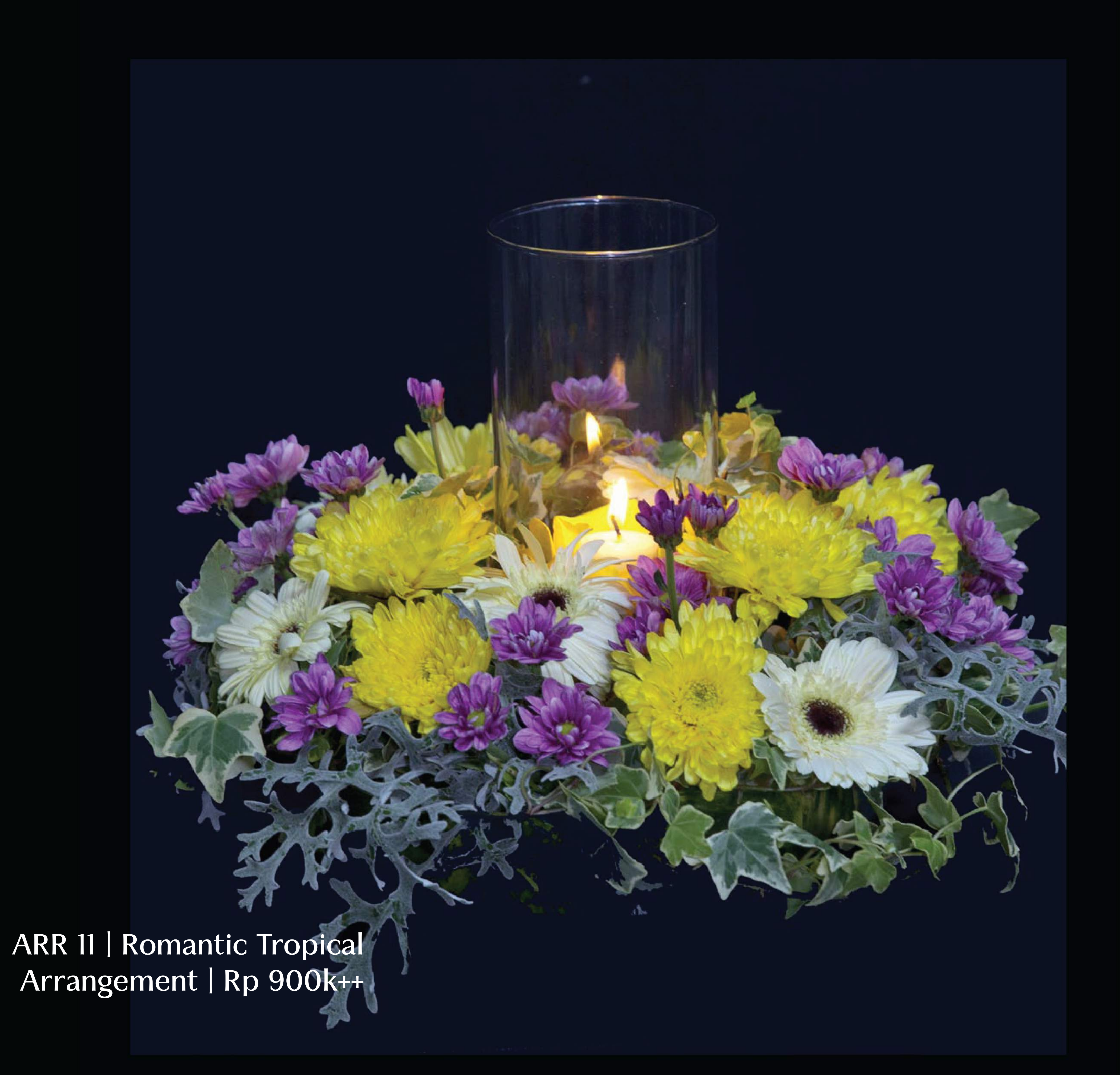
ARR 12 | Heart Shape Rose Combination Arrangement | Rp 1,050k++