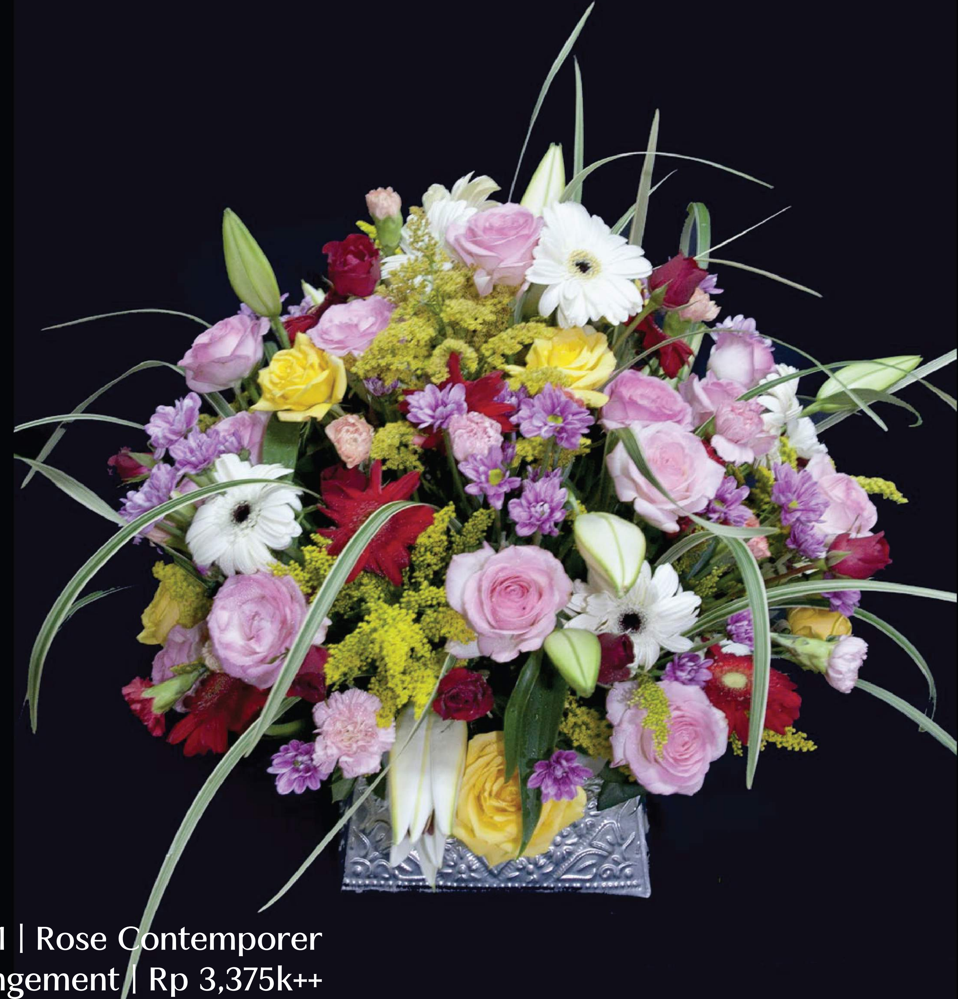
ARR 21 | Rose Contemporer Arrangement | Rp 3,375k++