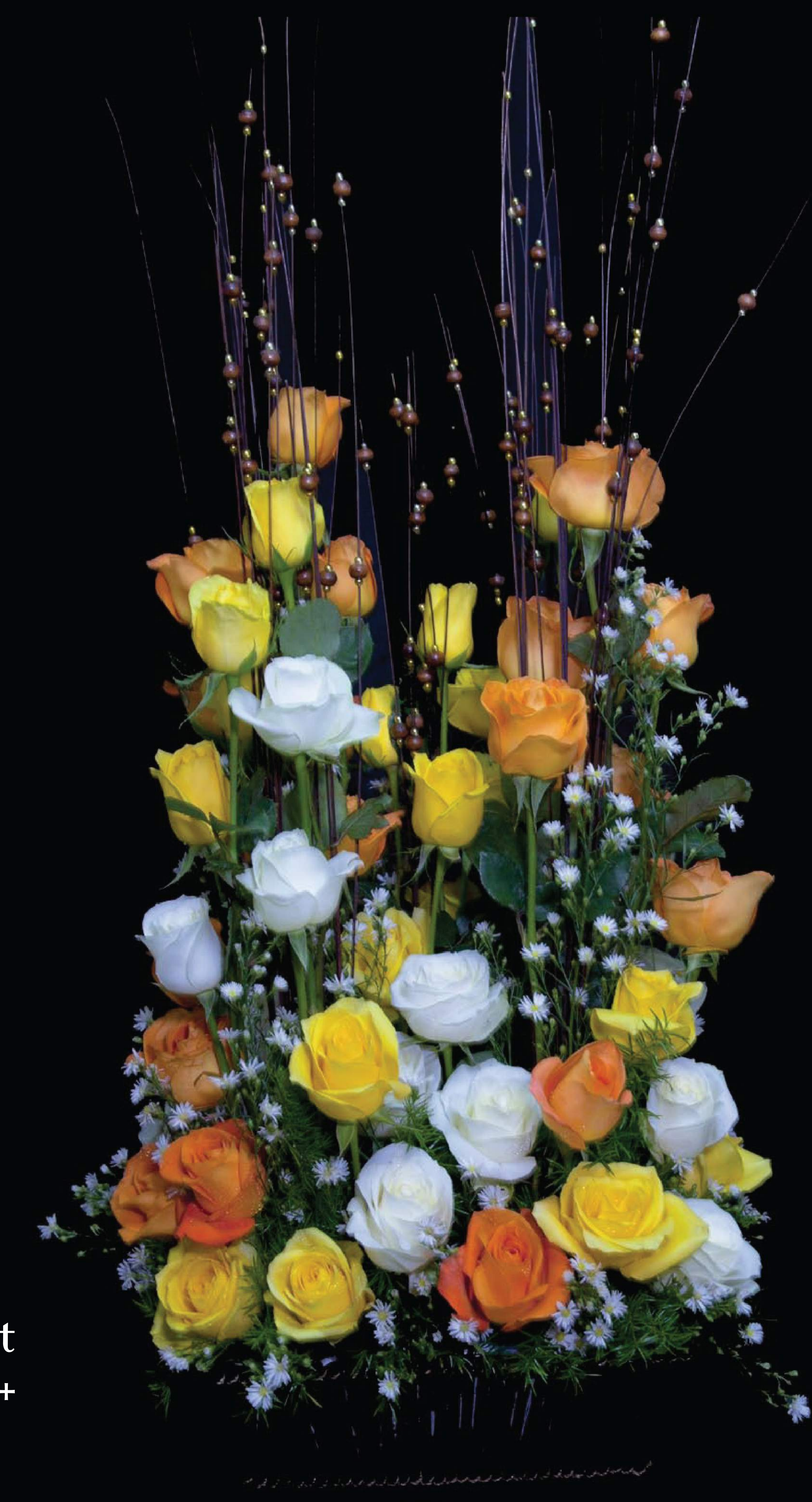
ARR 17 | Rose Stick Arrangement | Rp 2,250k++